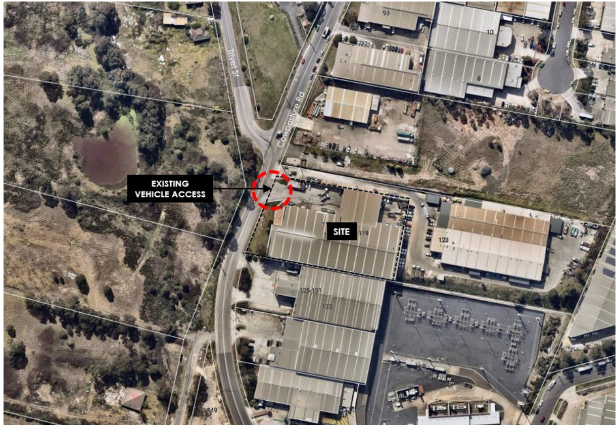
Figure 1: Existing Vehicle Access